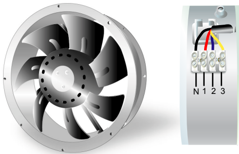
Triple Speed -1/2/3 (High/Medium/Low)

Black ----- Neutral wire Black + Red ----- High speed-1 Black + Blue ----- Medium speed-2 Black + Yellow ----- Low speed-3